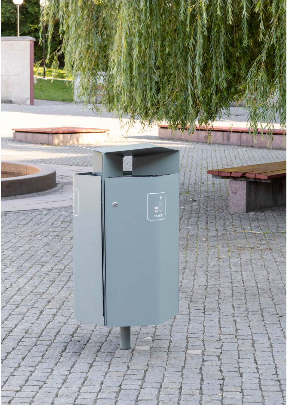
Arch W6521 for outdoor use lacquered in 7033